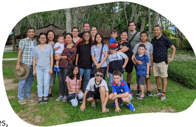
Ethnic Thai Team 2021

We know there is one true God who hears our prayers. We want to invite you to pray with us during this lent period for the Ethnic Thai people. This guide will help you to follow the needs and prayer points of the Ethnic Thai and the intercultural workers in the Global Interaction Ethnic Thai Team.